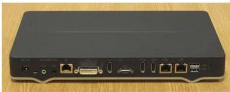
CODEC Rear view